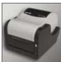
Small footprint for desktop and office use