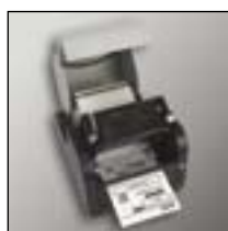
Easy media loading (5" OD labels can be loaded)